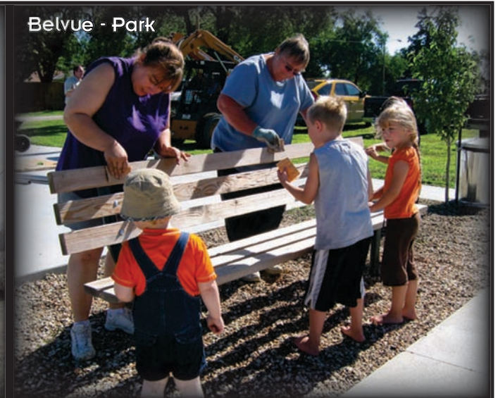
Belvue - Park