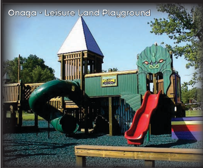
Onaga - Leisure Land Playground