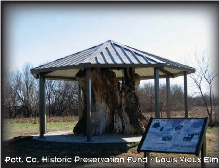
Pott. Co. Historic Preservation Fund - Louis Vieux Elm