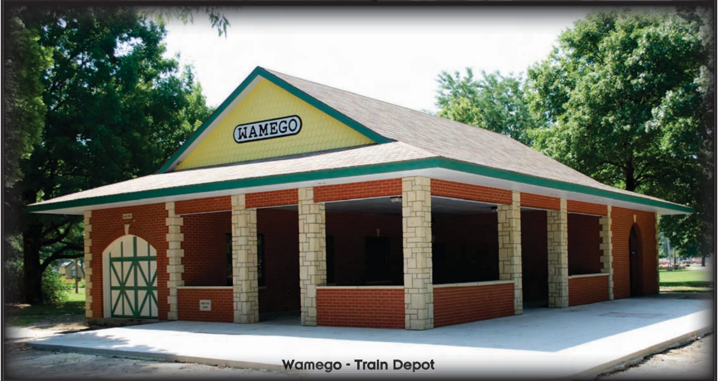
Wamego - Train Depot