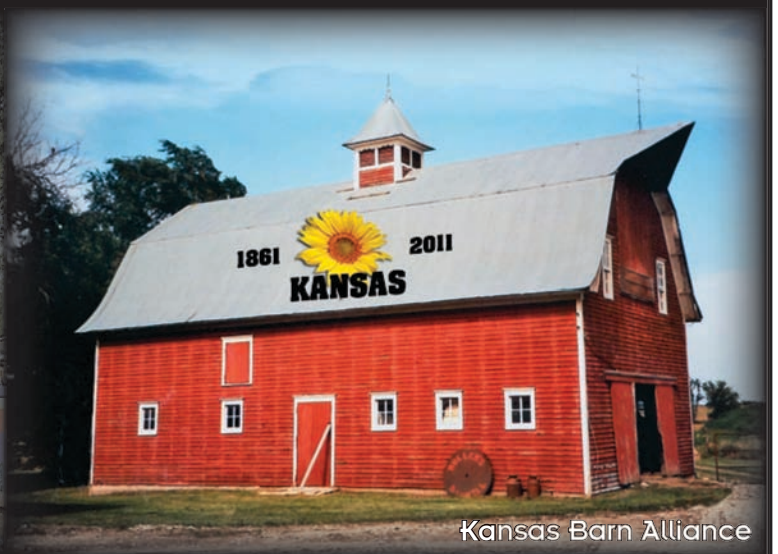
Kansas Barn Alliance